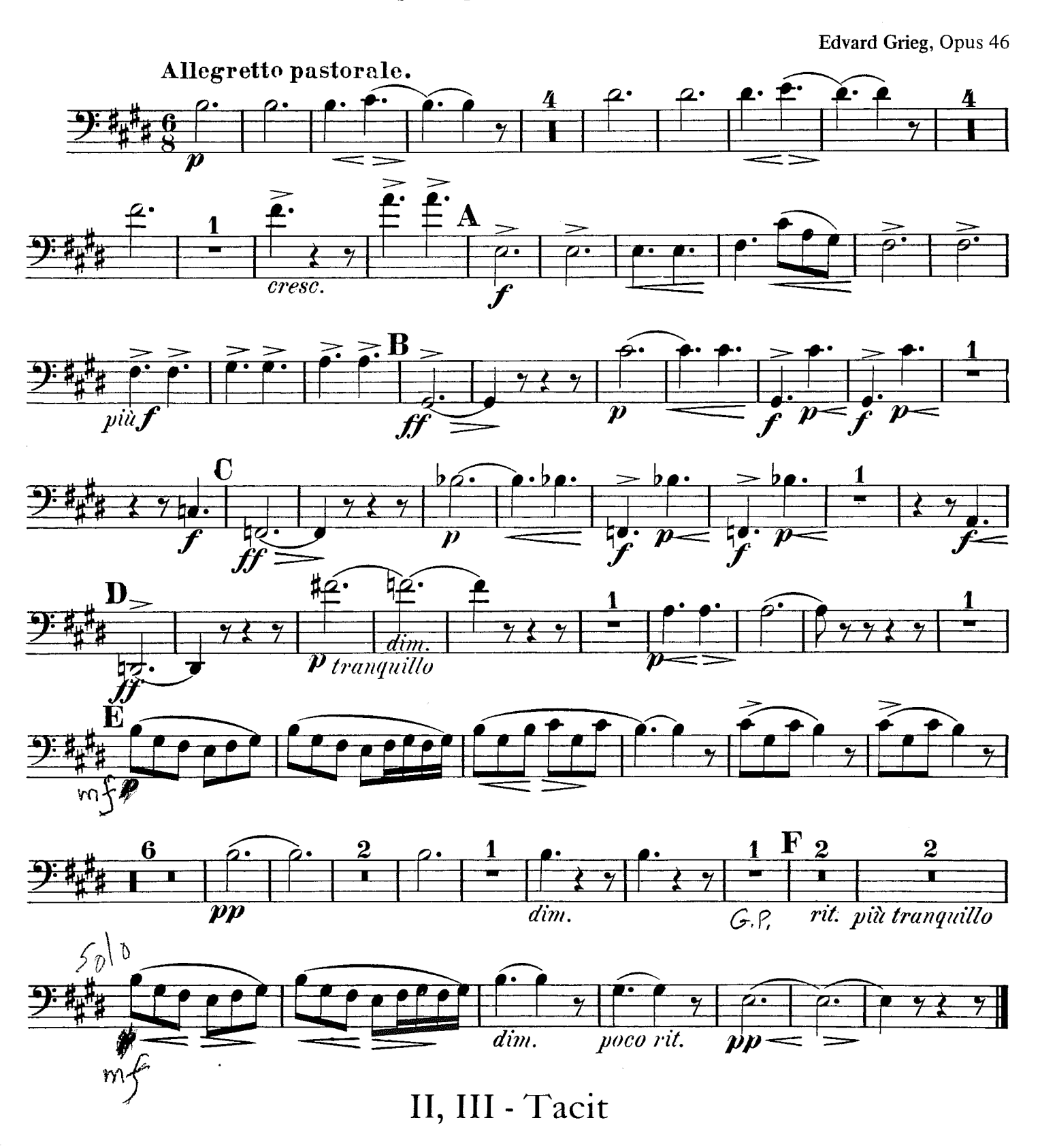
I - Morning [Morgenstimmung]