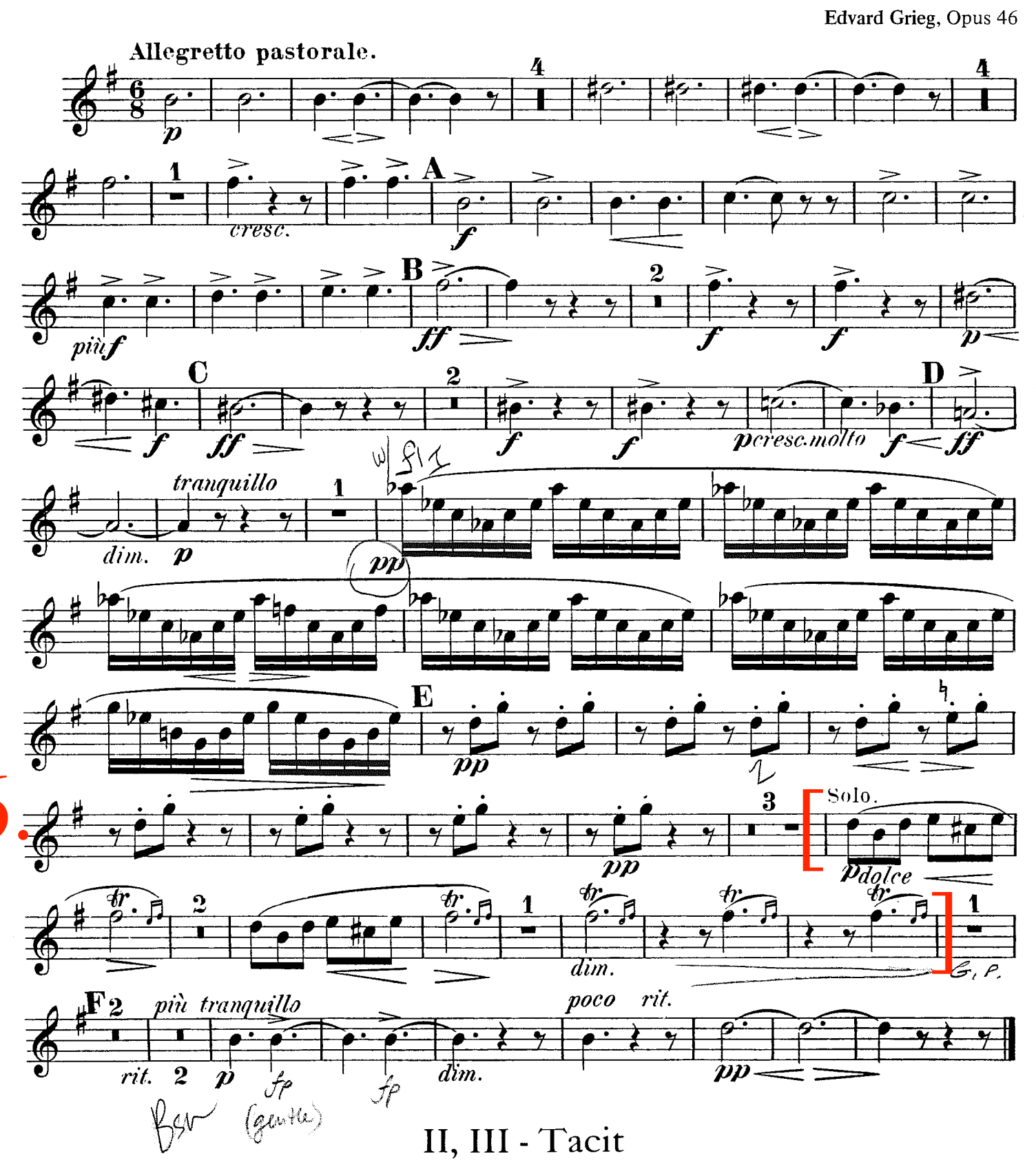
I - Morning [Morgenstimmung]