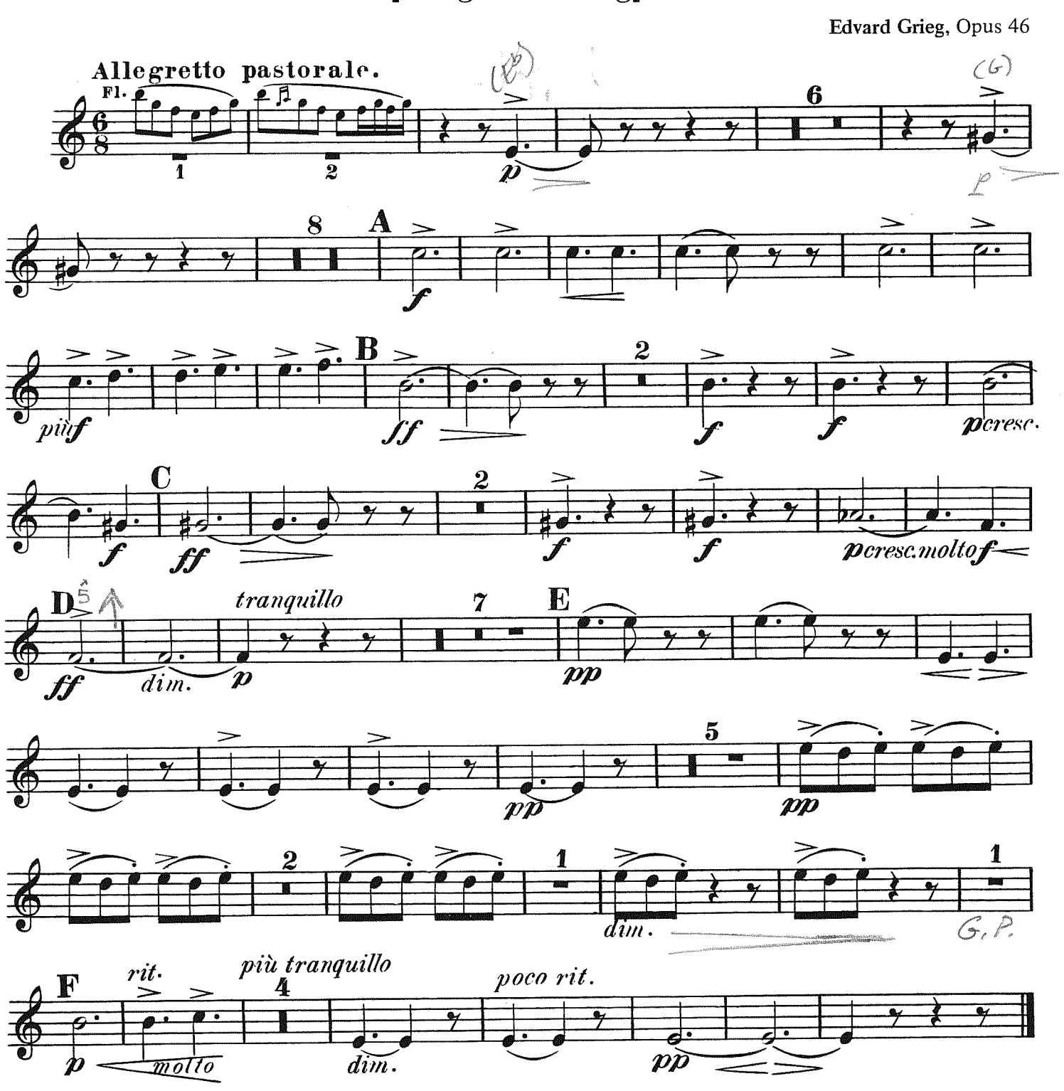
II, III - Tacit