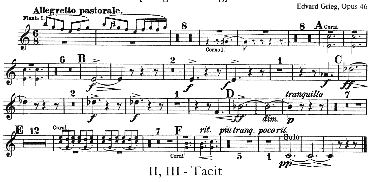
IV - Dance in the Hall of the Mountain King [Tanz in der Halle des Bergkönigs]

Trumpet I (E) I - Morning [Morgenstimmung]