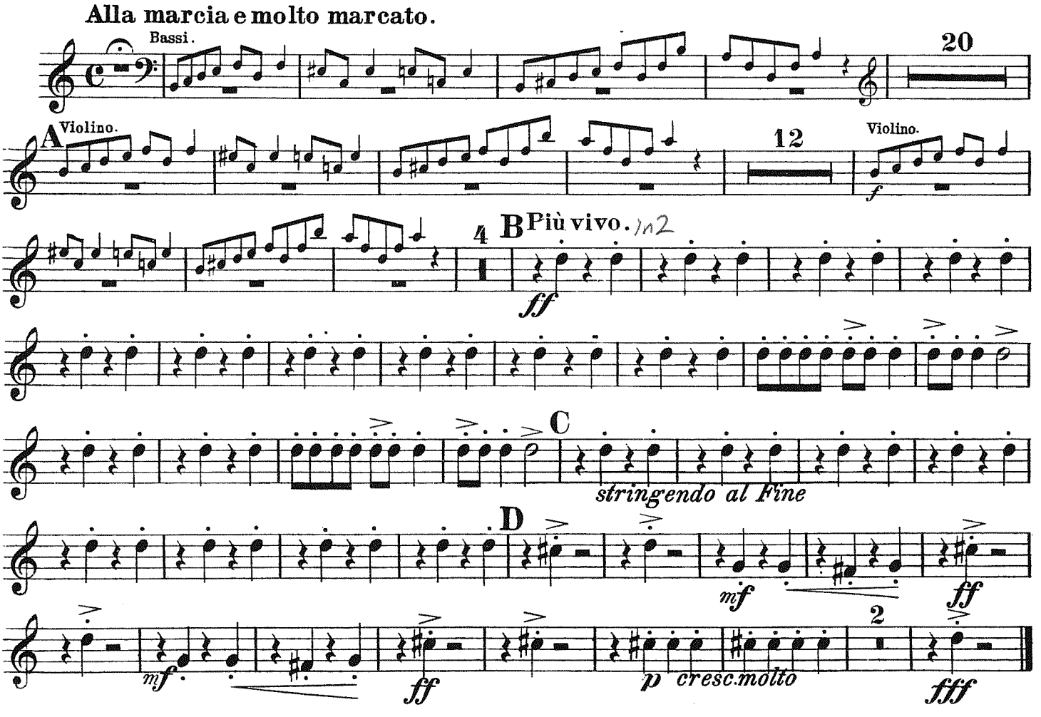
Luck's Music Library