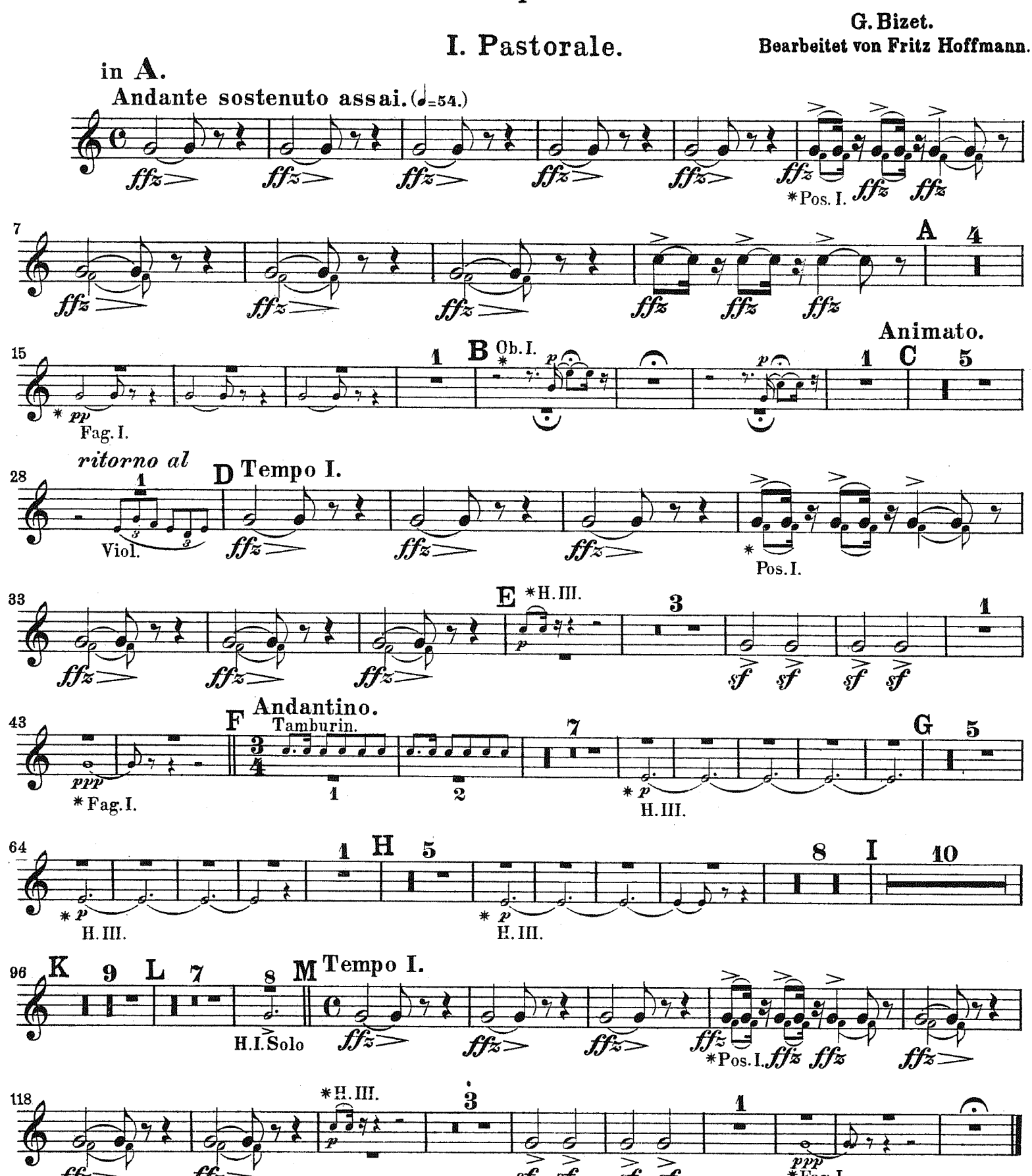
Bei kleinerer Besetzung werden stets die mit * bezeichneten Noten der nicht vorhandenen Instrumente gespielt.