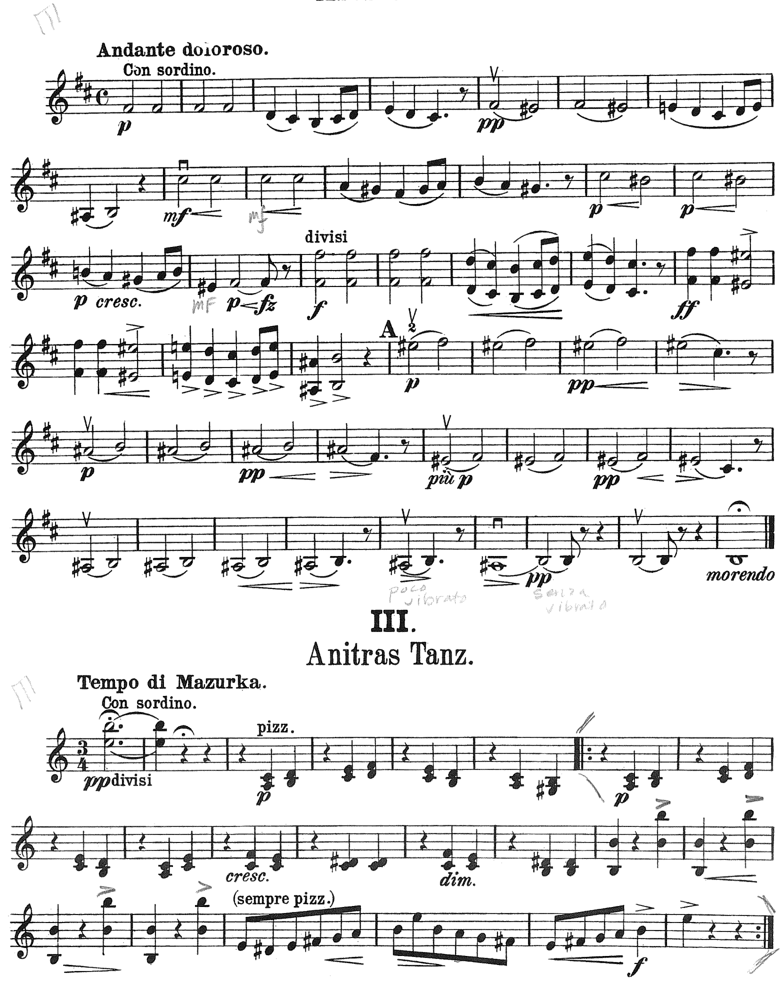
II. Åses Tod.